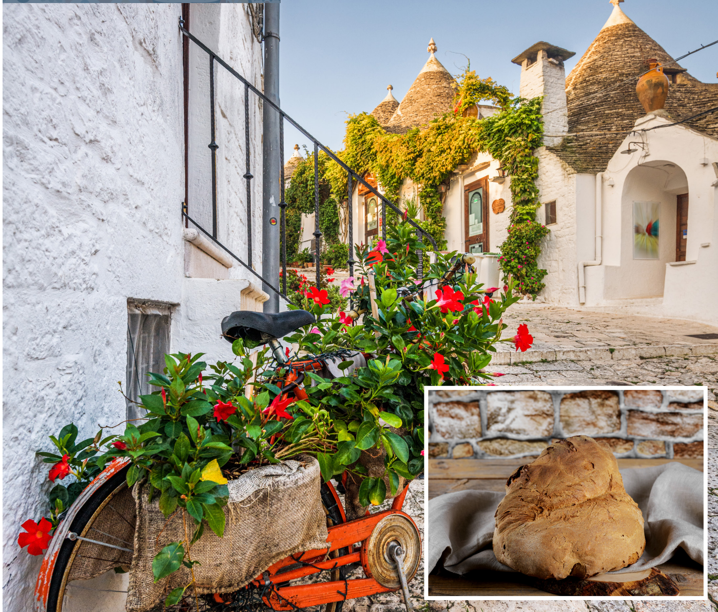
Trulli houses, Alberobello

7 Nights Inclusive From £1995 per person