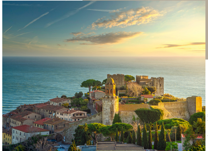
Castiglione della Pescaia