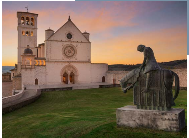
St Francis Basilica, Assisi

Guests can admire panoramic views of the Roman theatre from the first-floor terrace, unwind in the lounge and bar, and enjoy first-class regional cuisine at the restaurant. The attractive rooms feature garden or park views, satellite TV, private bathroom, air-conditioning, and Wi-Fi, thus ensuring a comfortable space to relax after sightseeing.