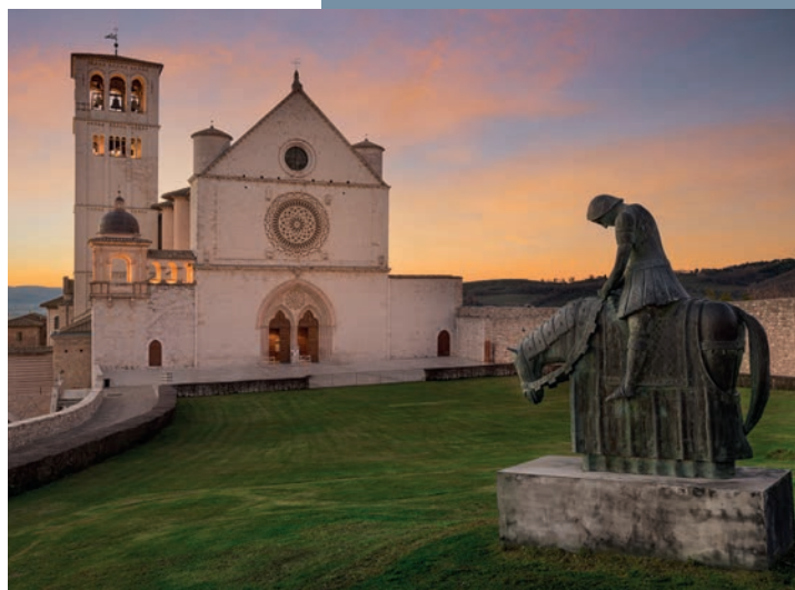
Basilica of St. Francis, Assisi

Guests can admire panoramic views of the Roman theatre from the first-floor terrace, unwind in the lounge and bar, and enjoy first-class regional cuisine at the restaurant. The attractive rooms feature garden or park views, satellite TV, private bathroom, air-conditioning, and Wi-Fi, thus ensuring a comfortable space to relax after sightseeing.